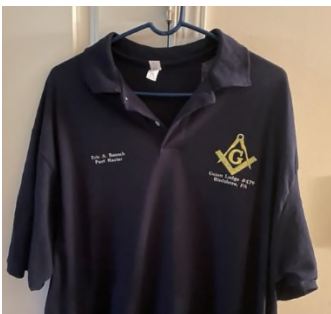
Dark Blue Polo