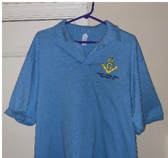
Light Blue Polo